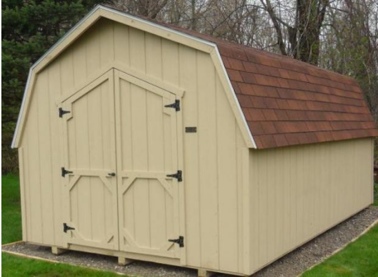
4' Sidewalls, 5' Double Doors (angled), 5/8" Plywood Floor