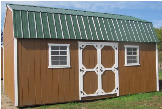
7' Sidewalls, 6' Double Doors, 3/4" T&G DryPly Floor, 2 6' Lofts 12-1/2ft. Inside Height