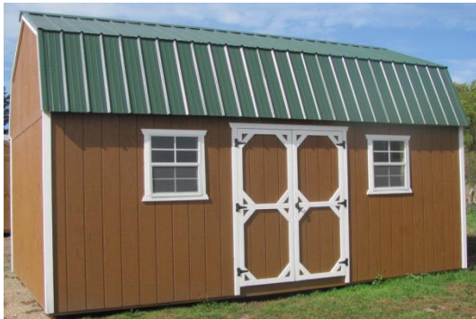
7' Sidewalls, 3/4" T&G DryPly Floor, 2 6' Lofts