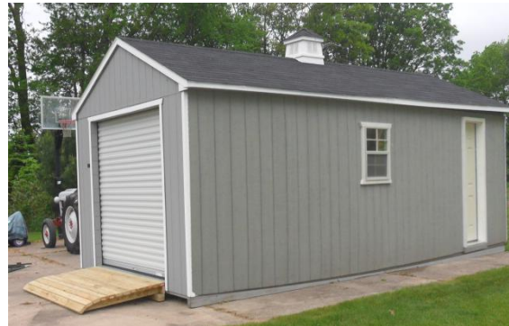
Includes: 8x7 Roll-up Door, 24x36 Window, 36" Steel Door, 3/4" T&G DryPly Floor and 4x8 Ramp