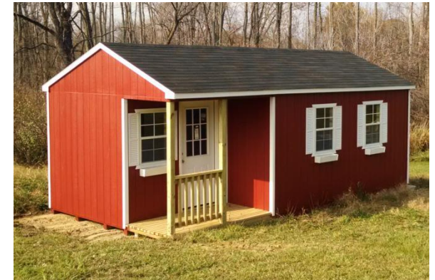
36" 9-Lite Steel Door, 3/4" T&G DryPly Floor, 3 24x36 Windows, and 4' porch