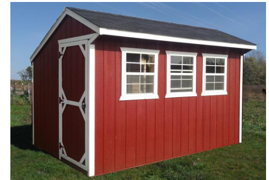
Includes: Man Door, Treated Floor, 3 18x27 Windows, 4 Nesting Boxes, Roost, & Chicken Door