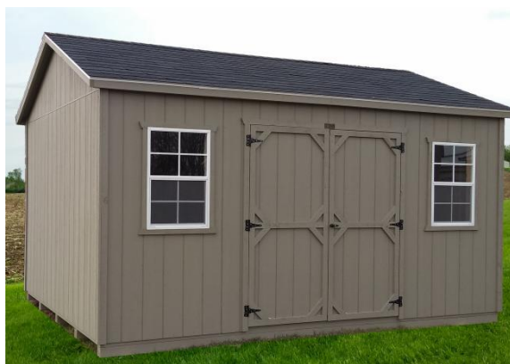
7' Sidewalls, 5' Double Doors, 5/8" Plywood Floor