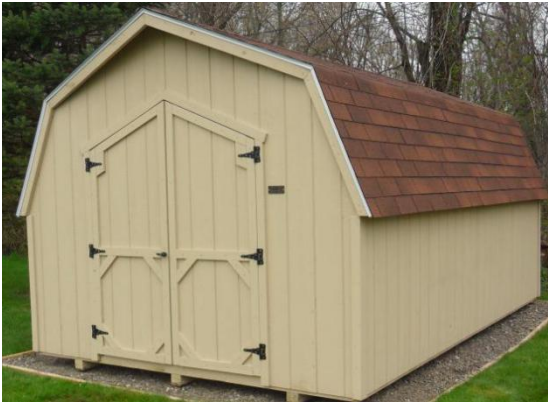
4' Sidewalls, 5' Double Doors (angled), 5/8" Plywood Floor